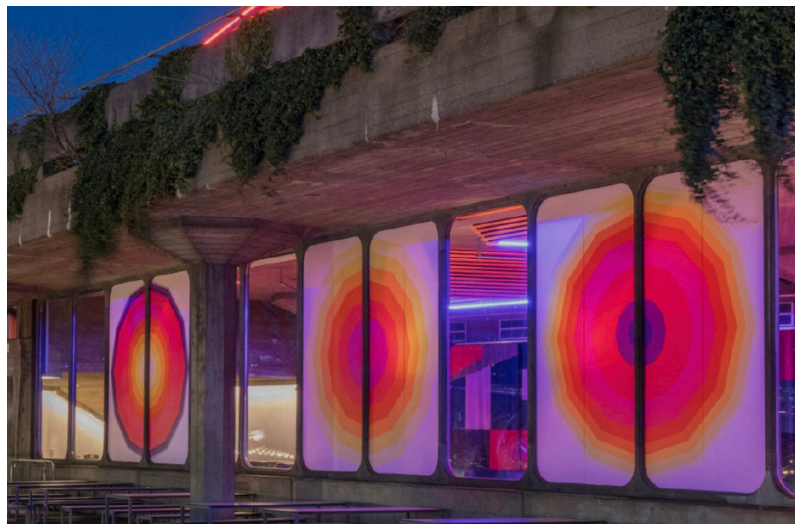
Image above left : Digital mock-up of the installation, above right: Window Murals courtesy of the Artist